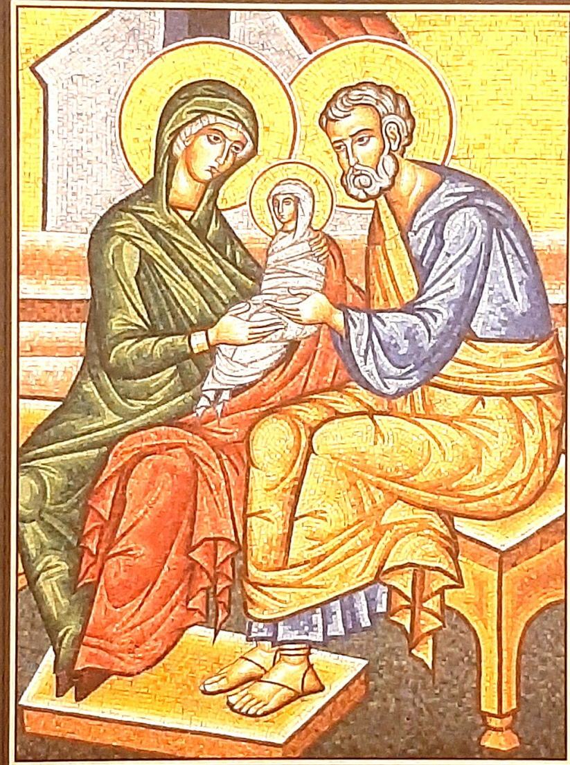
The Blessed Virgin Mary with her parents Joachim and Anna

If you are a guest or otherwise not a regular communicant, please give your baptismal name when receiving.