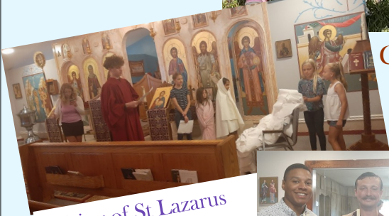
Raising of St Lazarus Reenactment