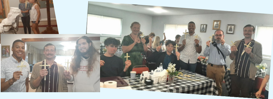
First Palm Crosses :D

More Pictures are Coming Up On Facebook and Instagram