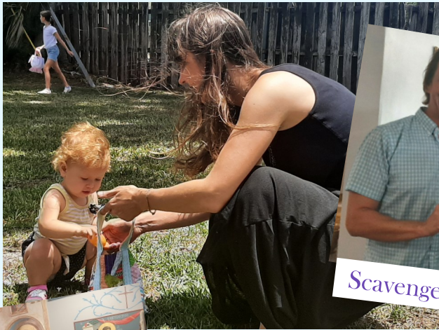
Scavenger Hunt Winner