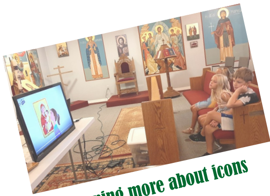
Learning more about icons