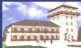
THE MONASTERY & CEMETERY