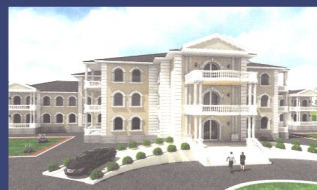
THE EPISCOPAL RETIREMENT RESIDENCE