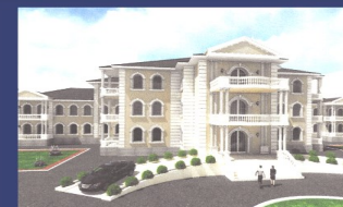
THE EPISCOPAL RETIREMENT RESIDENCE