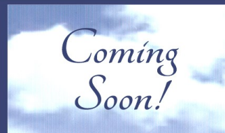
AN 'INDEPENDENT'/ ASSISTED LIVING FACILITY