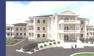
THE EPISCOPAL RETIREMENT RESIDENCE