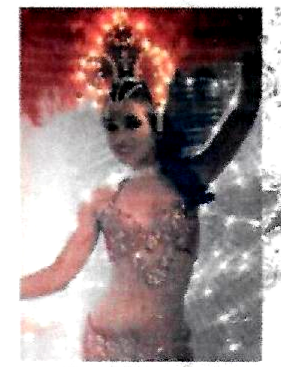
Bellydance by Cheeky Belly

St. Mary's Banquet Hall 1317 Florida Mango Road West Palm Beach